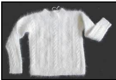
Figure 2. Sweater from Angora rabbit fiber [9]

1) Knitted clothes usually with a moderate fluffing effect, such as sweaters, scarves, woollen hats, socks, gloves, etc (Figure 2).