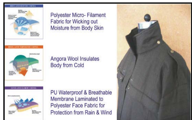
Figure 3. Prototype multilayer jacket with Angora rabbit fiber [4]

Angora rabbit fiber can be conveniently used in high-altitude clothing, especially those used by defence personnel deployed in sub-zero temperature regions [11]. Soldiers on duty at high altitudes require light, warm, breathable and waterproof clothing to get excellent protection from cold, wind and rain. Angora fiber is well-known for its high thermal insulation and its extreme lightness in weight. The plasma etching of Angora fiber has enabled in increasing the friction and cohesion between the fibers and facilitating spinning and weaving of 100% Angora fabrics. Therefore, the fabric from plasma treated Angora wool was used as a middle layer, which insulates body from cold, for making multilayer clothing to provide protection against cold, wind and rain. This is illustrated in Figure 3.