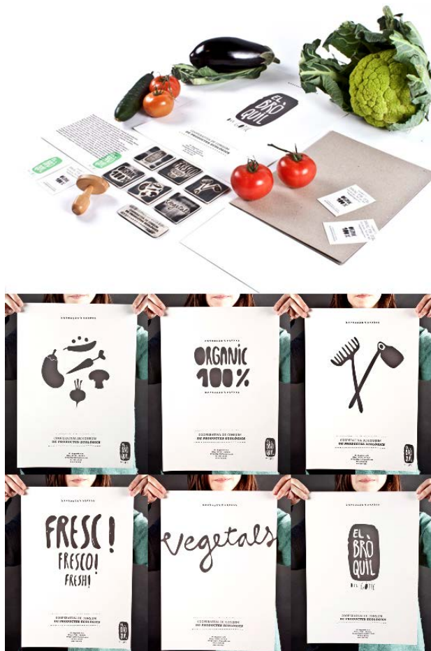
Figure 5. “El bròquil” food cooperative corporate identity.

members of the association, failed to come up to expectations. The members of the association who saw the results said they already knew and that no new conclusions had been drawn. However, the knowledge acquired by the students gave them a new focus to be able to propose a creation project to improve the one before.