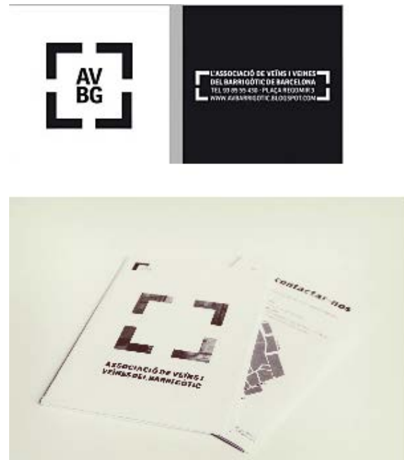
Figure 1. Logo and informative leaflet in student's first proposal.

After a couple of weeks, the students already had a final proposal, so a presentation was organised for the AVVBG delegate at the school. The application of creative techniques and the use of new technologies brought forth a bold, groundbreaking proposal aimed at an aggressive, powerful communication to accompany the vindicative nature of the AVVBG, as we had been told by its representative.