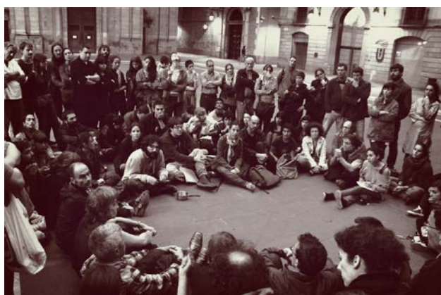
Figure 2. District's residents street assembly.

The field work was carried out using some of the traditional qualitative techniques: documentary sources (literature on the district, magazines, press, documentaries, etc.), distant observation (prospecting), and participant observation, making use of the bonds that had been sown with the residents' association in the work done on the informative leaflet, and in-depth interviews. The fieldwork helped to strengthen the bonds with the already known members of the residents' association and relationships were also started with other associates and residents. The students became involved in some of the activities carried out by the Association: the district assemblies and the organic food co-operative.