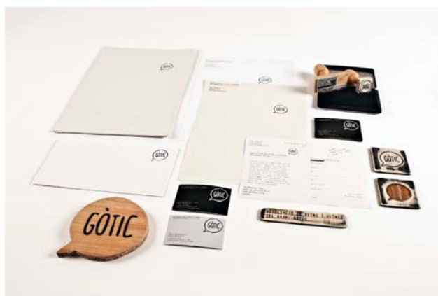
Figure 4. Corporate identity and stationery of students' second proposal, including low-tech applications.

The efforts made in the research process made some of the students drop out. Furthermore, the presentation of the results of the research, long awaited by some of the