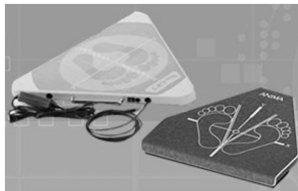
Figure 1. Gravi coder G620 (left) and foam rubber (right)

depending on weight distribution because its material resembles a soft cushion. The rubber can be placed on the G620 without any type of attachment (see Figure 1).