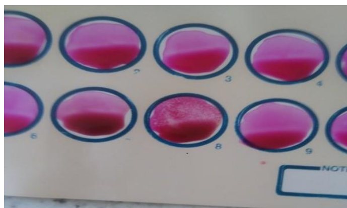
Figure 3. Image showing rose Bengal precipitation test (RBT) result