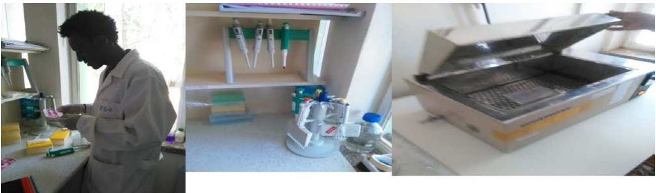
Figure 2. Images of NVI Serology laboratory

Two types of serological tests were employed as a screening and confirmatory test for the detection of Brucella antibody: The Rose Bengal Plate Test (RBPT) and the Complement Fixation Test (CFT), respectively.