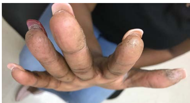
Figure 2. Patient’s right hand showing chronic changes along lateral aspects of fingers, and fingertips