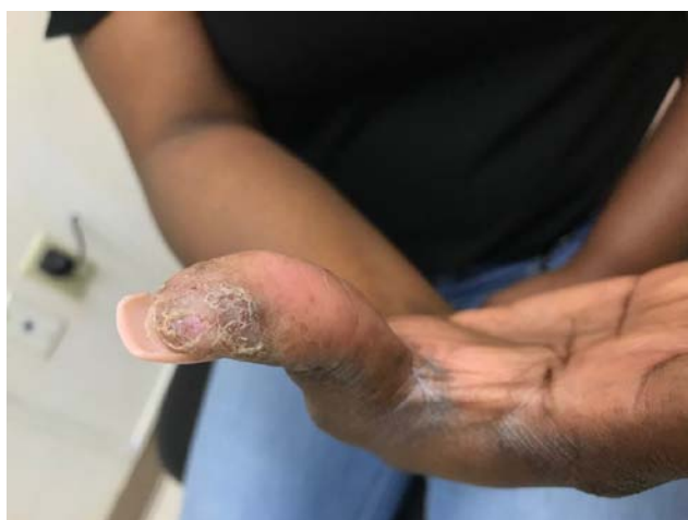
Figure 1. Patient’s right thumb showing subacute and chronic changes representing ruptured bullae, desquamation, and thickened superficial crusts in a characteristic distribution of dyshidrotic dermatitis

*Patient underwent subsequent total laparoscopic hysterectomy followed by complete symptom resolution several months after her initial procedure which failed to relieve her symptoms.