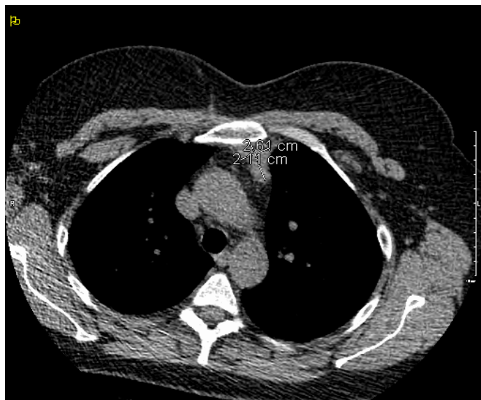
Figure 3. Shows Low Dose Lung CT reveals 2.61 by 2.14 cm (about 0.84 in) anterior mediastinal mass