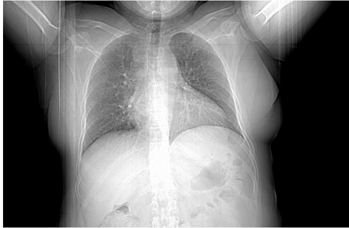
Figure 1. XR chest IV portable show a left anterior mediastinal nodule