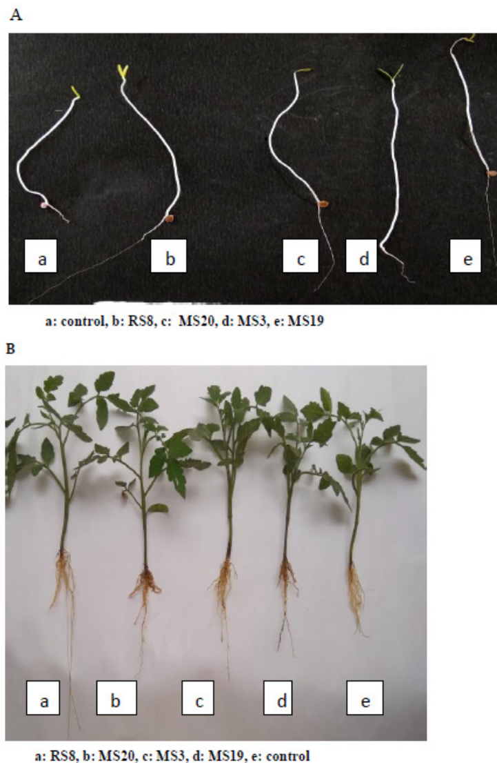
Figure 1. Enhancement of plant growth in tomato A. Seed germination by paper towel method. B. Pot study by inoculation with potential plant growth promoting bacterial isolates, RS8, MS20, MS3 and MS19