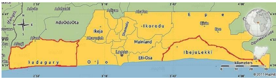
Figure 1. Map of Lagos State, Nigeria Showing the Study Areas

The study was carried out in ten (10) “purposively” selected fishing communities in the Lagos coastal area. From the eastern axis (Ibeju-Lekki), marked in red to the right hand side of the map, five communities were selected and they include Folu, Idasho, Olomowewe, Origanrigan and Oshoroko. And five communities selected from the western axis (Badagry), also marked in red to the left hand side of the map, were Asakpo, Ogorogbo, Gbethromey, Gberefun and Seishi. The selection of the communities was “purposive” based on fishing intensity and communities’ acceptance for the research to be conducted. Some fishing communities have been very hostile in recent times and refuse the conduct of field research. Structured questionnaires were administered among twenty (20) “randomly” selected fishers from each community and in total, 200 questionnaires were administered and retrieved. The 100% retrieval rate was made possible because the questionnaires were administered directly by the researchers who also assisted in completing them for the purpose of speed and accuracy. Focus group discussion, beach observation and direct interviews were conducted for further confirmation of some issues raised in the questionnaire as well as confirming the number of active fishing canoes. Physical observation of fish landing, counting and identification of types of fishing canoes at the beaches were made possible through this process.