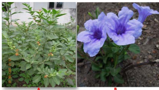
Figure 1. Mature plant of (A) Withania somnifera and (B) Ruellia tuberosa

Distinguished morphological (vegetative and reproductive) characters are key parameters which have been widely used for field species recognition, specially to delimit taxonomic ambiguity among species or the populations in the same species [29].