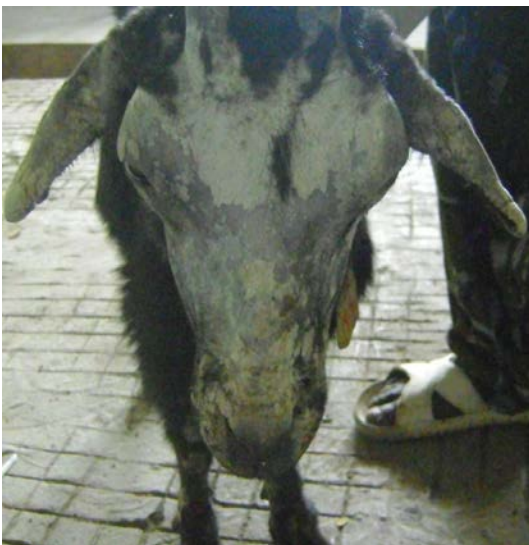
Figure 1. Showing hyperkeratosis, heavy crust formation, alopecia, wrinkling of skin and mite lesions on the head, ear and leg region

On clinical examination there was generalized wrinkling and thickening of the skin with heavy crust formation on the abdomen, forehead, ear, the limbs, interdigital spaces, mammary gland and inner thigh. Alopecia and erythema were also observed on these parts on the goat's body. foul smelling odour was perceived from the goat, several mites lesion were seen on all the limbs and the goat was vigorously biting its skin and rubbing its body against the examination table. (Figure 1)