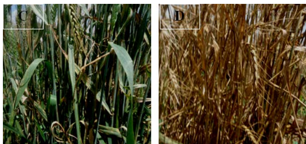
Figure 2. Photo of the resistant check variety, Danphe (C) and the susceptible check, Cacuke (D)