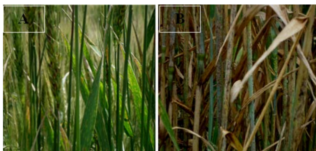
Figure 1. Photo of a resistant Kenyan variety, K.Swara (A) and a susceptible variety Pasa (B)