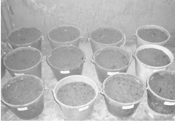
Plate 1. Pot experimental view on nematode control by chemicals and plant cakes

50g/pot and synthetic chemicals i.e. Furadan @ 35g/pot, Fipronil 3GR @ 35g/pot, and Rynaxapyr 0.4G @ 15g/pot were applied. Plant cakes and chemical nematicides were mixed thoroughly with pot soils. All pots were kept moist by sprinkling tap water as when required. Untreated pot was considered as Control. Pretreatment was done by counting nematodes before application. Second round application of the treatments were done after 2 weeks of the 1 st application.