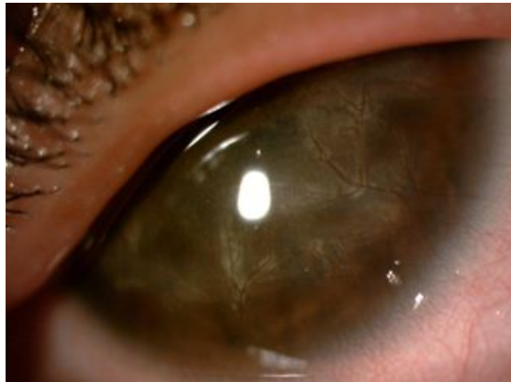
Figure 3. image showing a recurrence of interstitial keratitis,, after dose reduction of prednisone

Audiovestibular manifestations in the two groups were typical, similar to those of Meniere's syndrome with vestibular symptoms including vertigo and imbalance associated with nausea, vomiting, followed by progressive hearing loss of variable severity.