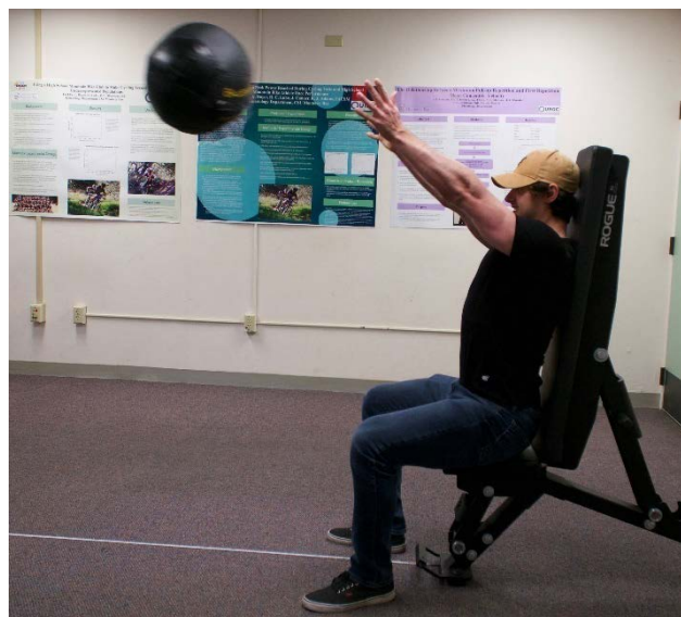
Figure 1. Seated Medicine Ball Throw (SMBT) test

The BB estimates kinematic and kinetic variables using data from the embedded accelerometer and gyroscope. The BB connects via Bluetooth to an iPad app from the BB manufacturer. Due to issues with drift common to inertial sensors, each BB throw repetition must start in a standard, static position to calibrate an accurate reference frame. Only peak velocity was used in this study because measures of mechanical power output would be based on velocity estimations by the device, hence accuracy of power measurements would be dependent upon accuracy of velocity measurements. The BB's measurement of peak velocity has been examined previously in other populations and modifications of the SMBT; Roe et al. [4] assessed BB peak velocity during a supine throw against 3D motion analysis in professional male rugby players. Similarly, Sato et al. [9] examined BB peak velocity during two variations of the standing MB chest throw against 3D motion analysis in resistance-trained adults.