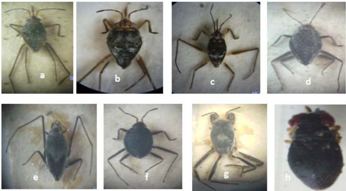
Figure 4. a) Haloveloides femoralis , b) Xenobates sp. 1, c) Xenobates sp. 2, d) Halovelia bergrohii , e) Halovelia esaki , f) Halovelia malaya , g) Hermatobates marcheii and h) Corallocoris marksae found in Badian, Cebu, Philippines