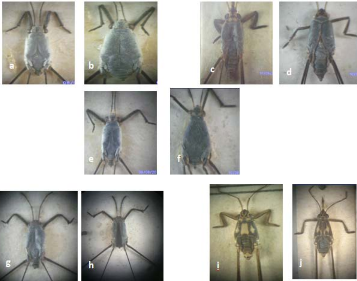
Figure 3. Halobates calyptus ♂ (a), ♀ (b), Pseudohalobates inobonto ♂ (c), ♀ (d), Halobates hayanus ♂ (e), ♀ (f), Halobates proavus ♂ (g), ♀ (h) and Stenobates sangihi ♂ (i), ♀ (j) found in Badian, Cebu, Philippines