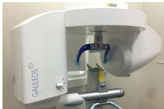
Figure 2. The mandible mounted in the focal trough of the CBCT unit GALILEOS Comfort Plus