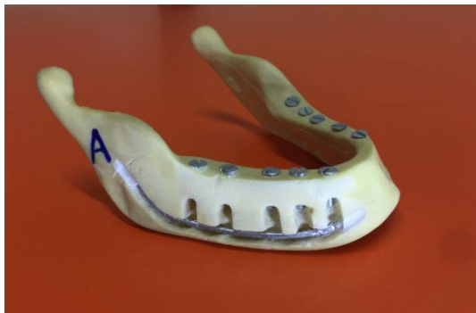
Figure 1. The polyurethane synthetic mandible with the implant analogues and the wire representing the mandibular canal

A plastic tube of 150 cm length and 20 cm diameter, with one of its ends covered with a transparent plastic sheet, was used as a stand for the artificial mandibles. The occlusal planes of the mandibles were made parallel to the floor, while the midsagittal plane was perpendicular to the floor. The CBCT unit GALILEOS Comfort Plus (Sirona, Germany) was used to scan the artificial mandibles. The CBCT unit operated at 98 kV, 3-6 mA, a focal spot size of 0.5 mm, and reconstructed the cross sectional images with the software SIDEXIS XG (Sirona, Germany) which was used for acquisition and processing of the images, and for measurement of the linear distances specified as seen in Figure 2 , and Figure 3 .