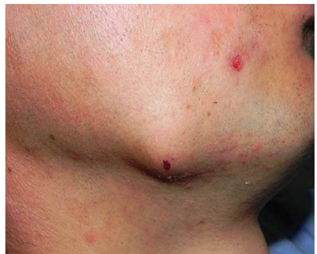
Figure 1. Extraoral photograph shows a swelling on the right mandibular posterior region

asymmetry in the right mandibular region. He didn't have a history of trauma or injury to his jaw and had a non-contributory medical history. Extraoral examination revealed a diffuse swelling measuring about 1cm. x 1,5 cm. and it had an oval shape (Figure 1). On palpation the swelling was non-tender and bony hard and it was strongly attached to the body of mandible. Skin overlying the swelling showed adhesion because of the mass due to local irritation and trauma. Intraoral examination revealed a well-defined subperiosteal mass on the buccal plate of the right mandible which extended from the right lower of first molar to the second molar. Overlying mucosa was normal and the lesion was hard to palpate. Additionally, we examined a deep carious lesion in the mandibular right first molar and it had exposed pulp.