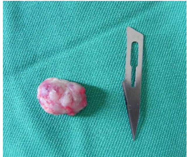
Figure 3. The appearance and size of the mass after surgical excision.

The proposed treatment involved surgical excision with the patient under general anesthesia. A full-thickness buccal mucoperiosteal flap was reflected from the right-side of first premolar to second molar. The mass appeared well circumscribed and attached pedicle to the side of the mandible body. Intraoperatively, the limits between the normal bone and the lesion were unclear, even though the latter was protruding and it was harder than normal bone. After the bone mass was exposed adequately, it was excised with the chisel, mallet and rotary instruments. After the cortical plate of mandibular body was debrided and smoothed the flap was sutured. A part of the protruding lesion was harvested to obtain a definite histological diagnosis (Figure 3). Microscopic examination of the specimen revealed, the tissue structure differed significantly from the normal bone structure such as vital compact and mature medullary bone tissue, showing osteocytes and medullary spaces containing a loose connective tissue with capillaries. Histologically, the diagnosis of peripheral osteoma was confirmed (Figure 4).