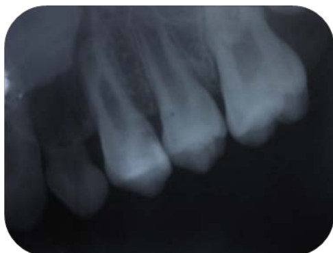
Figure 3. After 6 months