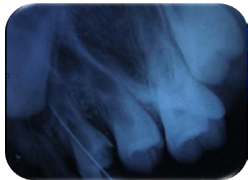
Figure 1. Initial radiograph

restoration on maxillary right first premolar and the intraoral periapical radiograph revealed maxillary first premolar with an open apex, thin dentinal walls and a file up to the apical extent of the tooth (Figure 1).