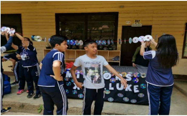
Figure 4. Students working together to finish a project

Differences in the pretest and posttest scores of the students in collaboration for both teaching methods were studied using one-way ANCOVA and are summarized in Table 4. The analysis of the covariance yielded an F value of 2.144 and a computed probability value of 0.148, which is higher than the 0.05 level of significance. This led to the failure of rejecting the null hypothesis. This means that there is no significant difference in students' collaboration skills as influenced by the two teaching methods. This suggests that students' scores in the two experimental groups were not significantly different from one another. The current research was found consistent with another study wherein the students make substantive decisions based on group agreement, take an essential role in implementing the project, work also depend on each other to complete the project [22]. This means that students' collaboration skills have developed. It has also been reported that the appropriate use of social skills can generate a positive impact on collaboration [23]. Besides, PrBL and PjBL are about learning and motivation for learning by the application of more student-centered learning principles [24]. This could have been the explanation for the absence of difference for both of the teaching methods. This further implies that the lack of difference between the two teaching methods could mean that both groups may have equally developed collaboration skills.