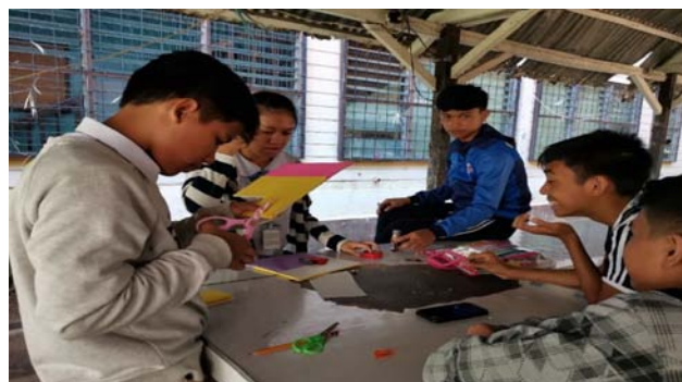
Figure 3. Students working together to finish a project

As shown in Figure 3 and Figure 4, students' are working collaboratively in small groups towards a common goal, and that is to solve a problem and to finish a project. The collaboration of students would also mean attending group meetings regularly, contributing ideas to group discussion, completing assignments on time, preparing work in a quality manner, and demonstrating a cooperative and supportive attitude. It is noted that students appreciated the quality of working relationships, the independent way in which group work was facilitated, and the chances for freedom of action and thought [20]. This is due to the real-life activities and ample time that was given to the students to solve problems and create projects. Likewise, among the five fundamental elements involved in collaborative learning, students who are utilizing PrBL and PjBL developed individual and group accountability, group processing, interpersonal, and small group skills [21].