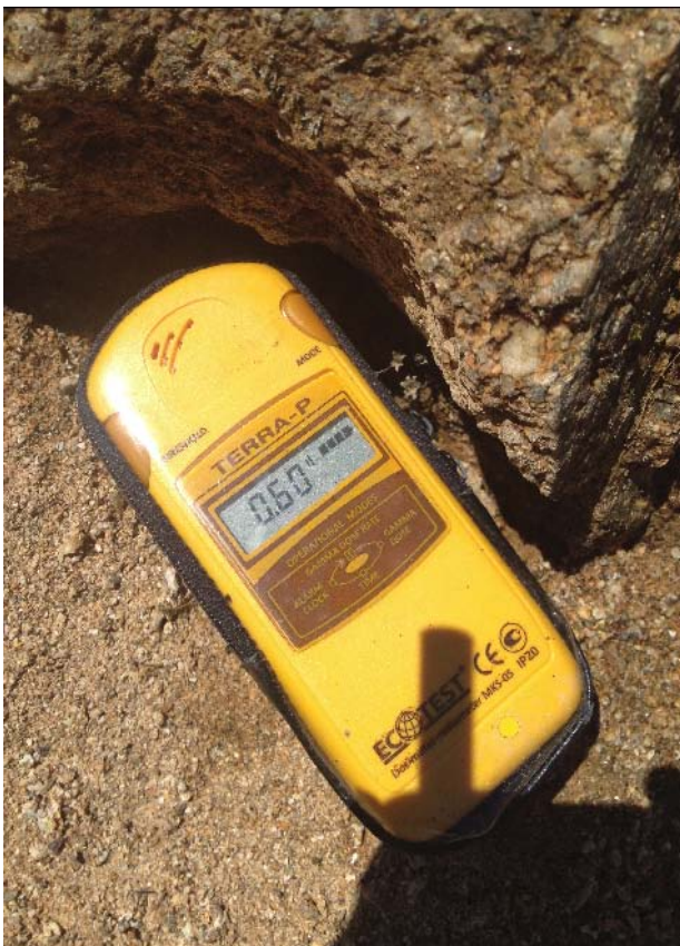
Illustration 1: The shadow of the antenna is another Geiger - Smart Geiger from private company Technonia - used to countercheck

mark later hidden under a pseudo-Greek root and the place is in the south-west of the municipality, which was formed in the merging of two smaller villages, Thélis and La Combe, the patch tested is on the Thélis side just near La Versanne, another village that could have a name influenced by the event if it is actually an homage to St Anne pouring water 5 - the name Versanne was given during the Revolution, obviously villagers decided to conceal the Christian influence they wanted to keep from eyes of revolutionaries by inverting the reference to the saint & to the act of pouring water - a very healthy water must come from a saint, or from angels in Christian interpretations of the phenomena, as in the other terminology for La Versanne, Ruthiange. Ruda (bellowing...) is the origin of that second name, it became Ruth (as in rut du cerf in French), we see the same grammatical change, demonstrating that Délice is the origin for Thélis and that very delicious waters pouring from a saint were once found there, after the battle of the godless soldiers of the Roman Empire.