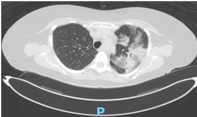
Figure 2. Computer tomography (CT) of the chest without IV contrast on initial presentation