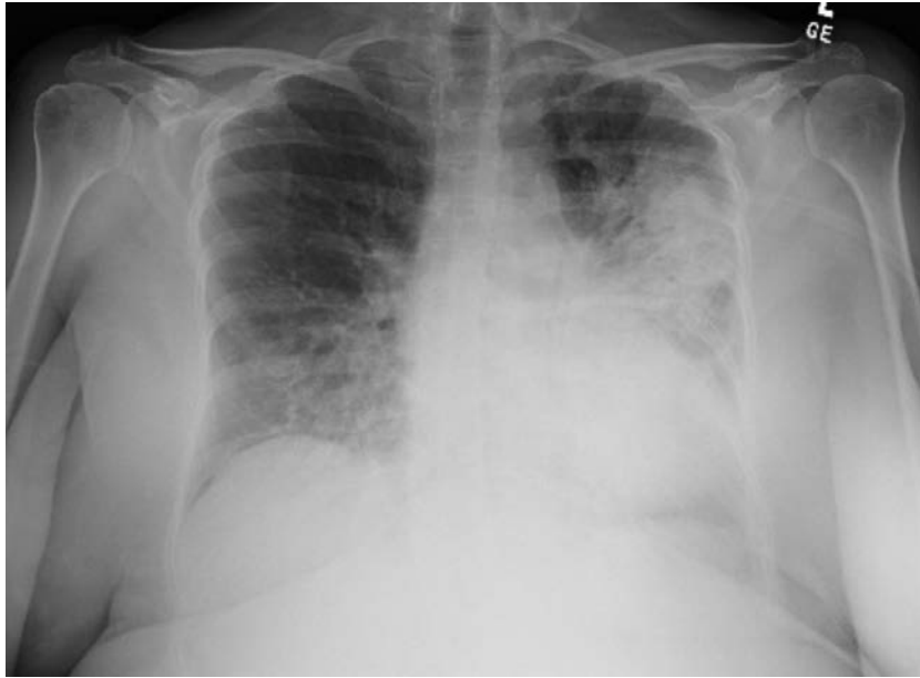
Figure 1. Chest radiograph on initial presentation

status improved and was stepped down to the regional medical floor with a plan to discharge with outpatient Rheumatology follow up.