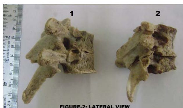
FIGURE-2: LATERAL VIEW