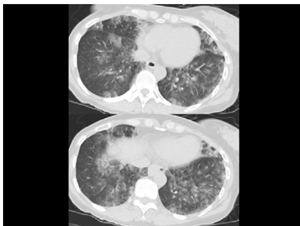
Figure 2. Chest computed tomography (CT) on arrival. CT showed diffuse infiltrative lesions in the bilateral lung fields. No gas was observed in the vessels or heart

Chest X-ray showed infiltrative lesions in the bilateral lung fields. Computed tomography (CT) also showed the same lesions without gas in any vessels (Figure 2).