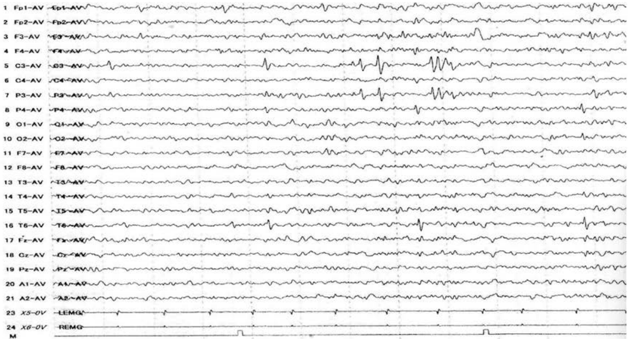
A. Before everolimus treatment

At age 7 years, her EEG indicated high voltage irregular slow waves intermixed with spikes and polyspikes (hypsarhythmia). At age 4 years, her impaired social interaction gradually developed. Everolimus treatment (2.5 mg/day for 24 weeks) improved social impairment, however, her seizures and epileptiform discharges did not disappear. Thus, at age 9 years, she received complete corpus callosotomy, leading to disappearances of seizures and epileptiform discharges.