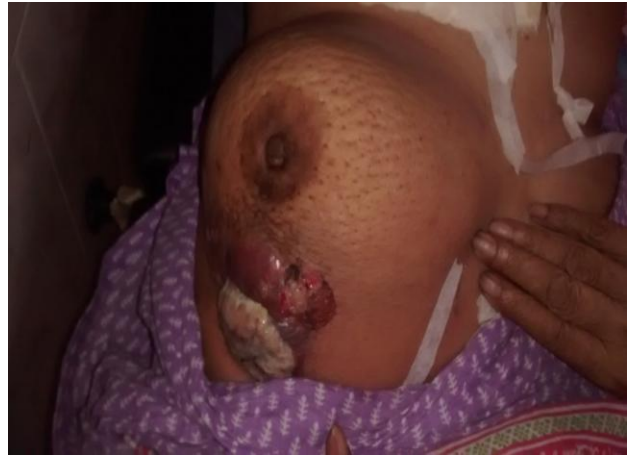
Figure 1: A fungating mass involving the left breast

involving the left breast [Figure 1] for 5 months duration.