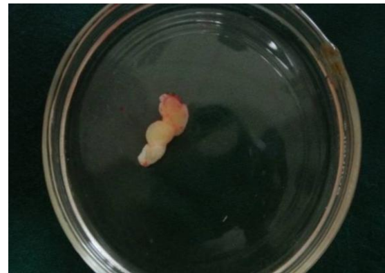
Fig.3: PRF matrix placed in 2% Metronidazole solution