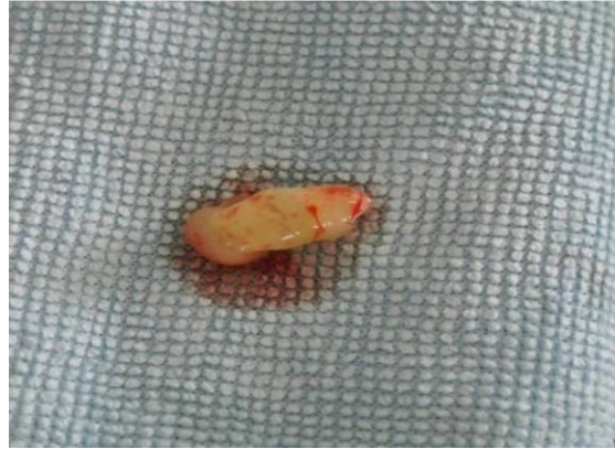
Fig.2: PRF matrix without 2% metronidazole solution

moderate significance and P value \leq 0.01 was considered strongly significant.